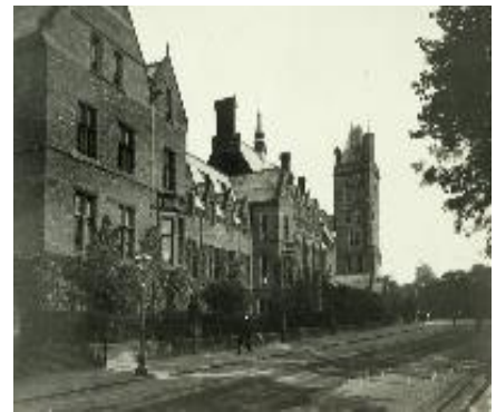
Liverpool Royal Seamen's Orphan Institution