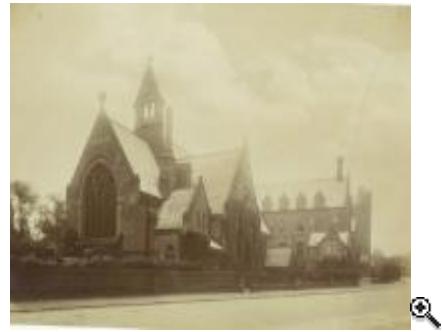
An external view of the Seamans Orphanage, Newsham Park, Liverpool dated 1895

In April 1870, Liverpool City Council donated a plot of land in the North East of Newsham Park for an orphanage. On the 11th September 1871, the foundation stone was laid by Ralph Brocklebank and within a few months £8,000 had been raised for the building. In January 1874, 114 children moved into the orphanage and it was officially opened on 30th September 1874 by Queen Victoria's fourth son the Duke of Edinburgh.