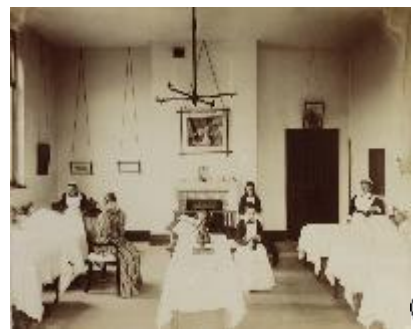
Liverpool Seamen's Orphan Institution.

At the start of World War Two, preparations were made for the children at The Seamen's Orphanage to be evacuated. This took place on the 11th September 1939, exactly 68 years after the foundation stone was laid.